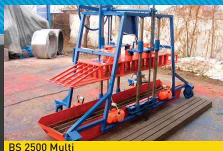
BS 2500 Multi