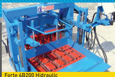
Forte 4B200 Hidraulic